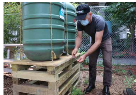
Collected rainwater can be used to fill up watering cans for garden plants, or for washing hands, tools, etc.