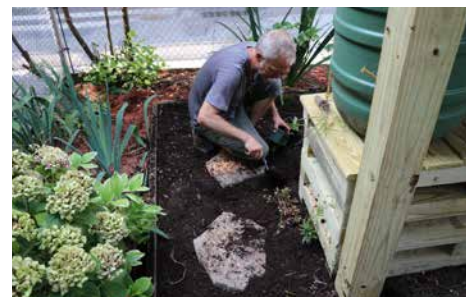
To help prevent any possible flooding from the downspout on this system, a small rain garden was installed next to the overflow from the rain barrels. This small 4x5' area—excavated and filled with gravel, landscape fabric, plants, and stepping stones—will provide an overflow area for any excess water entering the system.