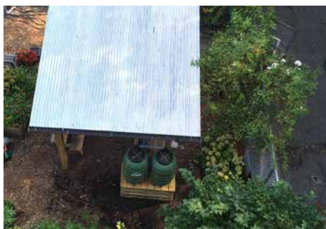
A 10x10' shade structure serves as a collection surface for rainwater in the garden. This roof will fill up both barrels during a typical rain storm.