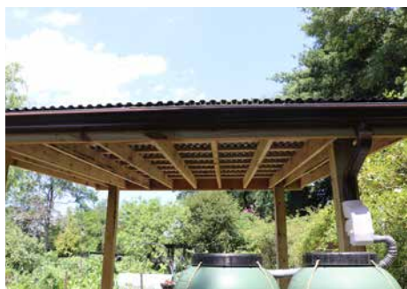
A gutter, downspout, and diverter move water from the roof into the two rain barrels.